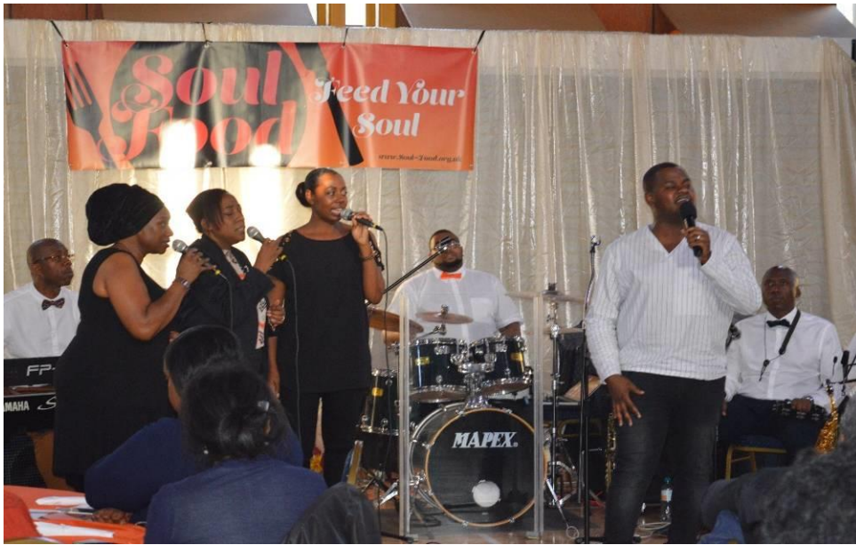
One of the singing guests at the Soul Food event with a backing group