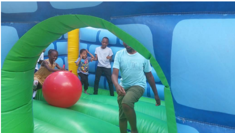
Kids just wanna have fun on the bouncy castle at the Health Fair