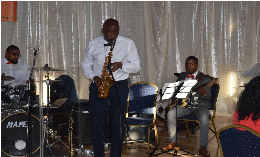
A part of the Quintessential band at Soul Food event