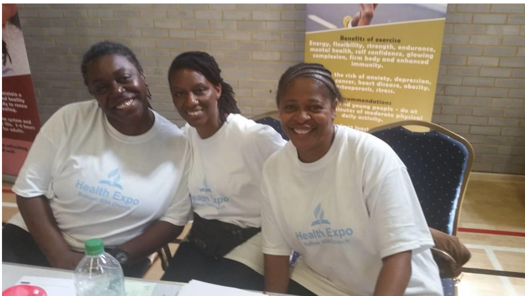
Some of the Health Fair staff: They just had to get into my picture