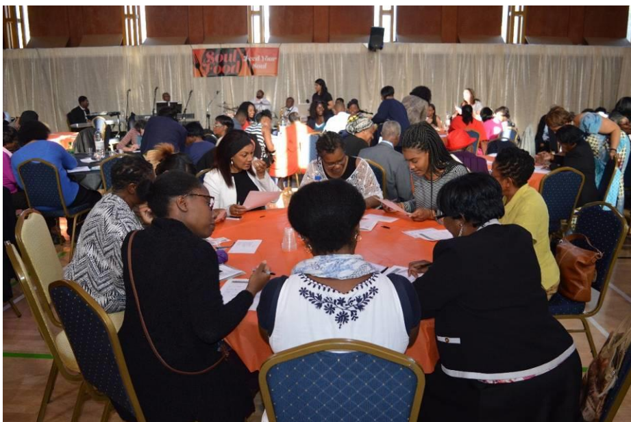
Another group of guests at the Soul Food event during the icebreaker