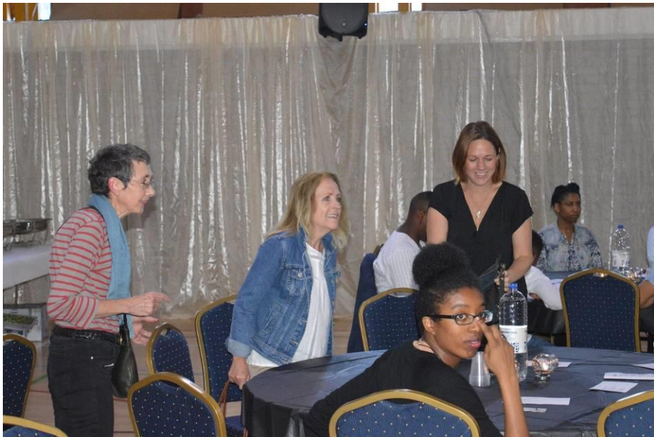
Some of the guests at Soul Food working on the icebreaker