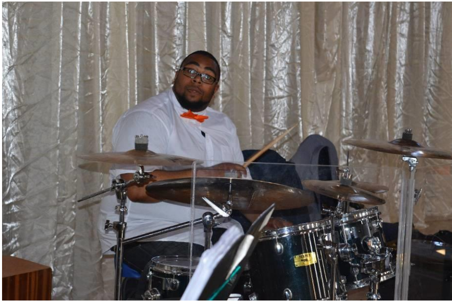
Drumming away at Soul Food