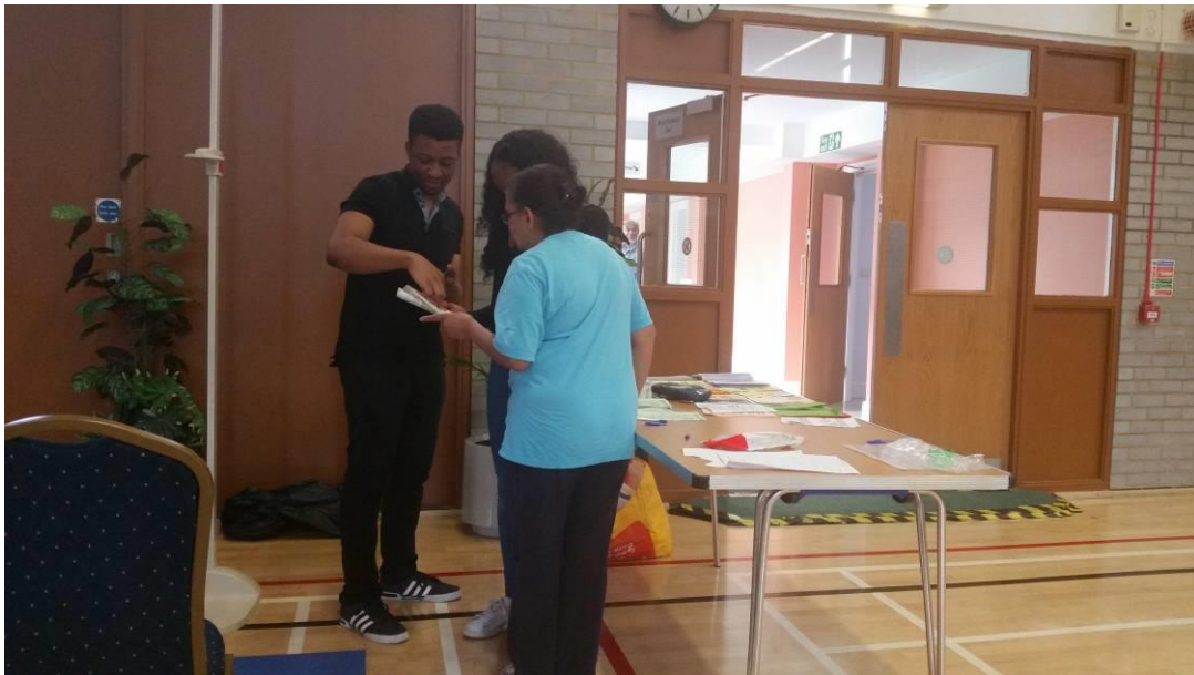
Health numbers being discussed at the Health Fair