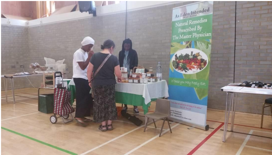
One of the stands at the Health Fair