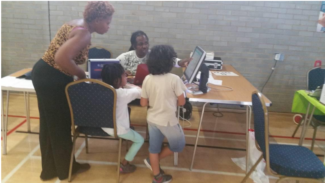
Enlightening the kids about Health at the Fair