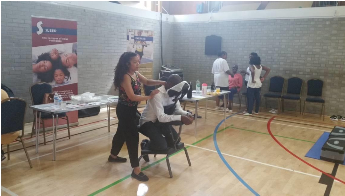
A head massage at the Community Health Fair