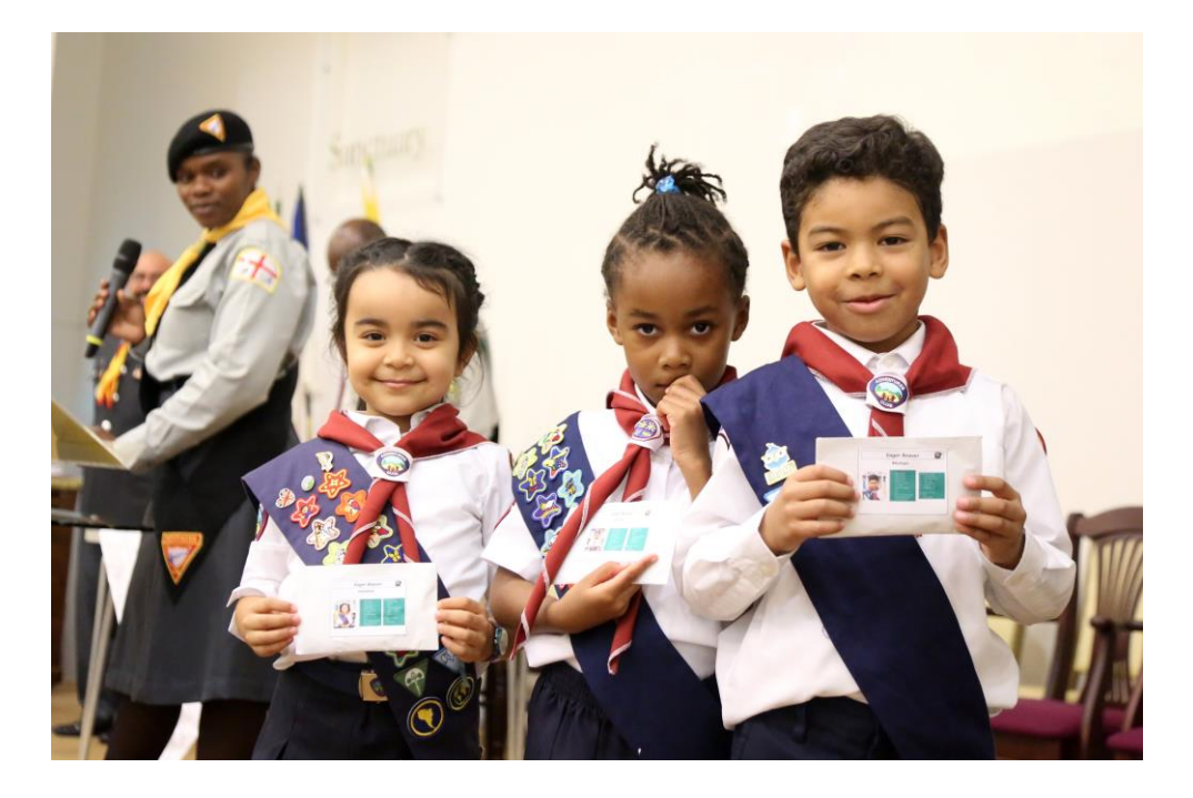
Some of the adventurers with their honours