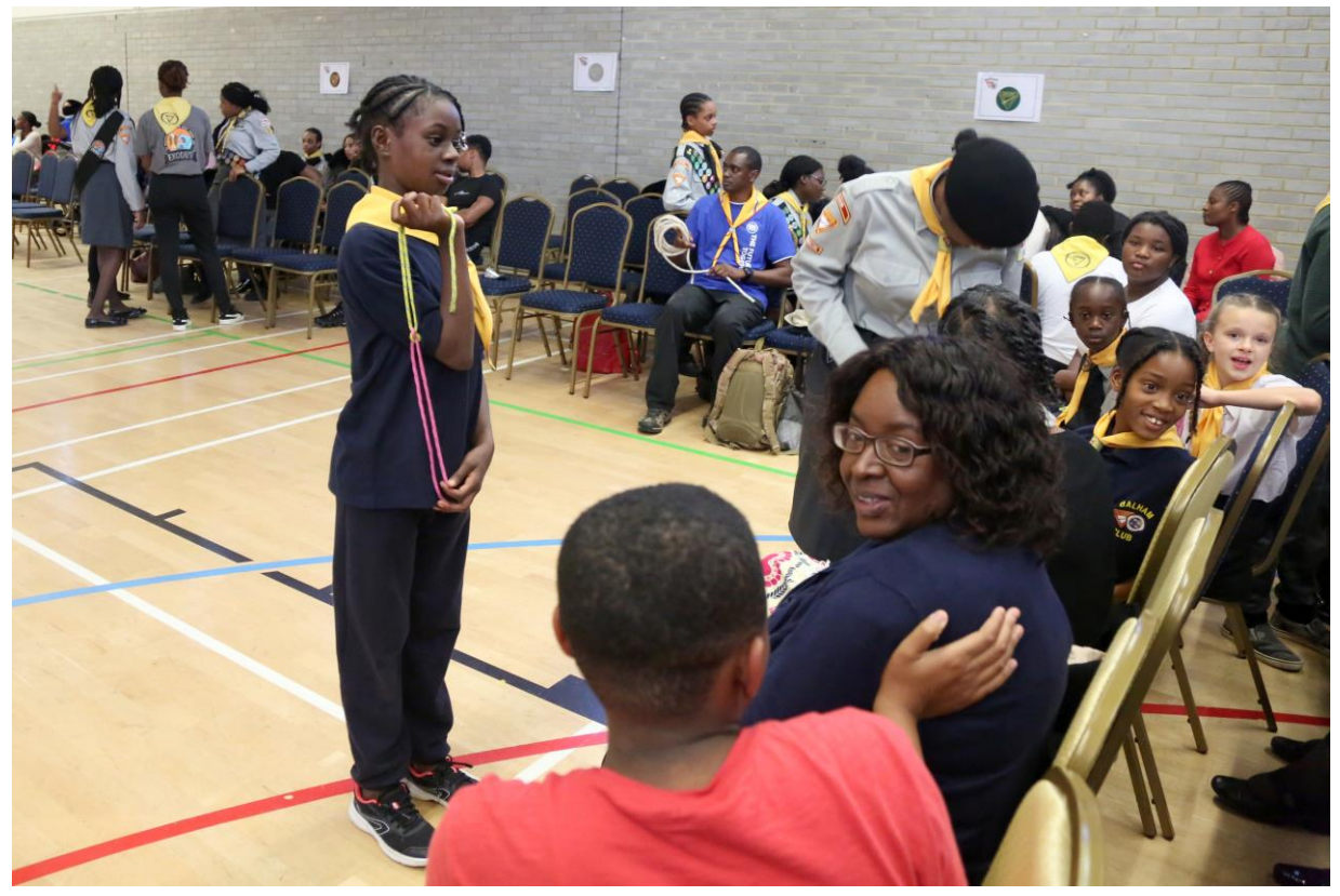
Adventurers teaching how to do knots