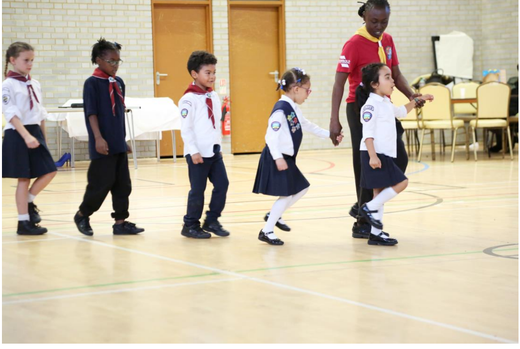
Some of the young ones doing their drilling

The two comperes for the afternoon programme in relaxed mode