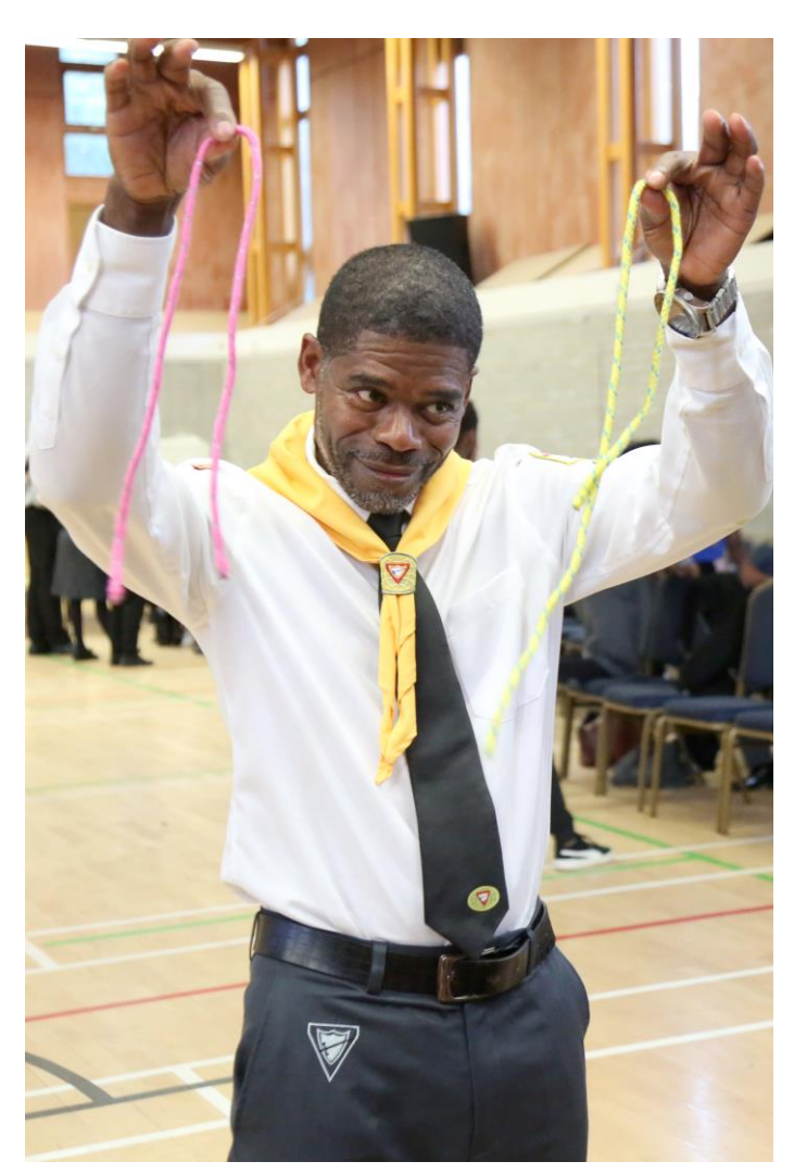
and that's how you untie it