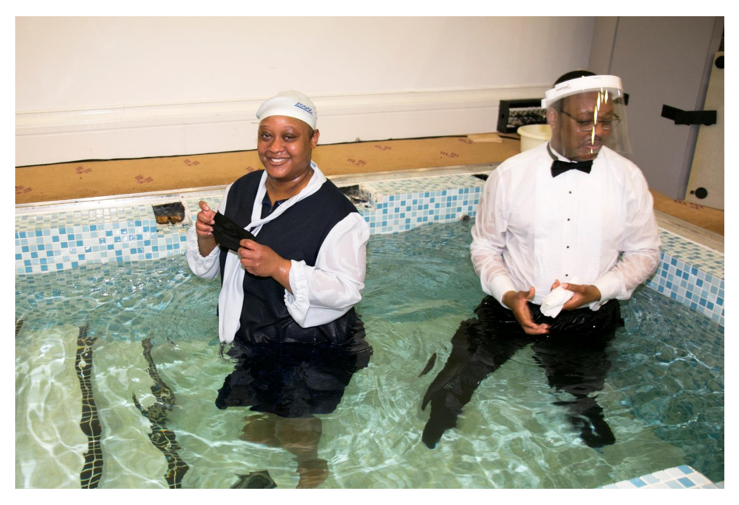
Shimmarie just after her immersion: relaxed and smiling